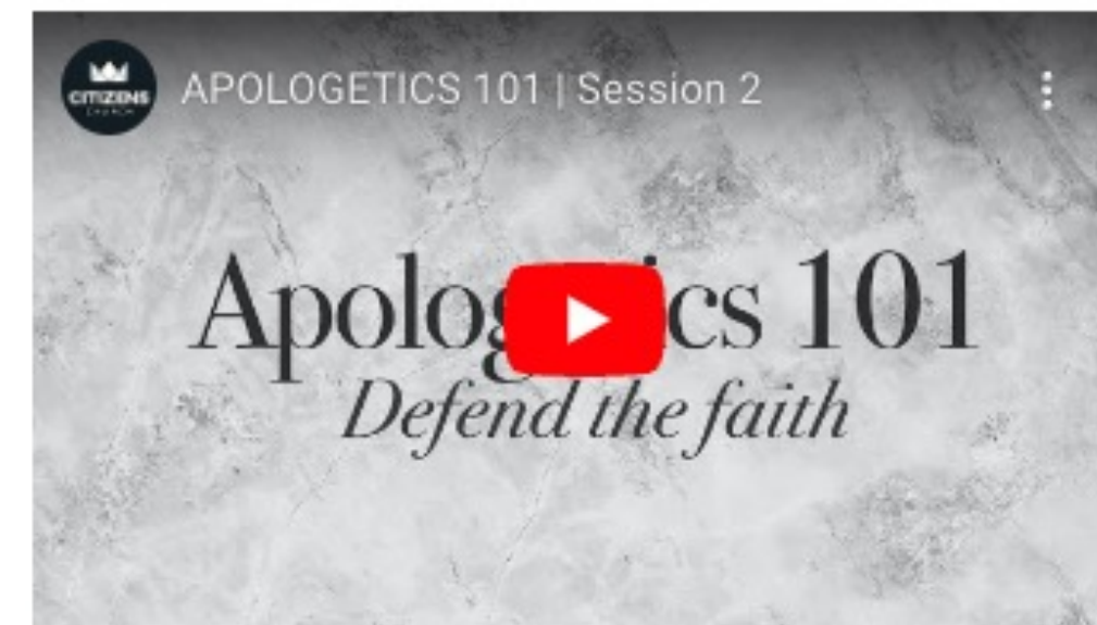
Session 2 - Answering the Questions