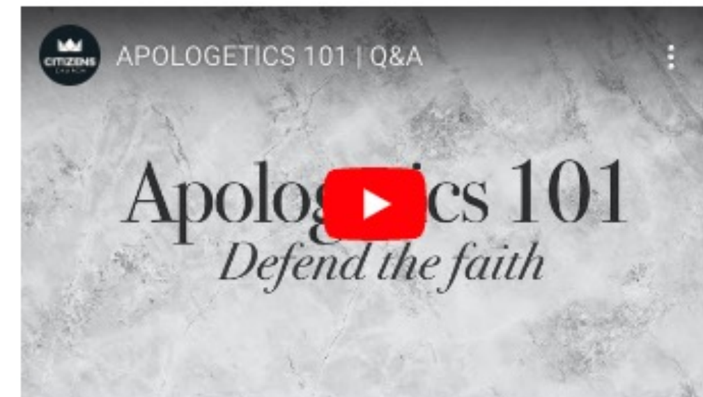
Session 4 - Q&A