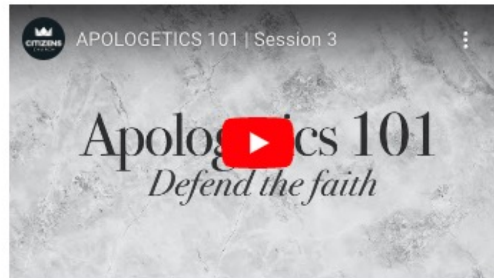
Session 3 - Questioning the Answers